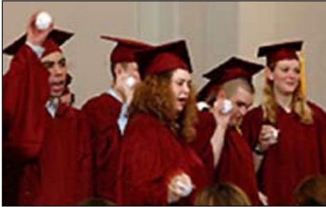
Threshold graduates toss balls in celebration