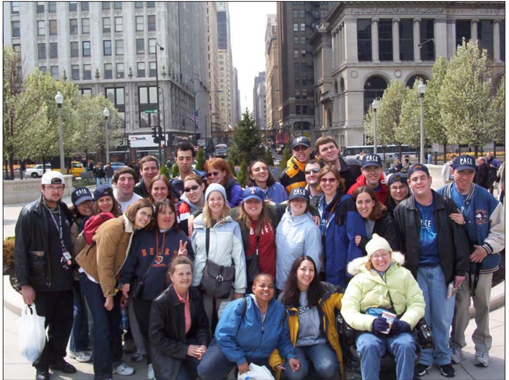
Threshold’s 2005 Transition Year students and faculty with PACE students from National-Louis University.

Saturday started with breakfast at the hotel, then off to explore Chicago with our hosts. We took advantage of the excellent public transportation system and set off via train to visit Navy Pier. Prior to our visit we learned about the famous Ferris Wheel in class from our hosts and were eager to ride it. Navy Pier was reminiscent of Faneuil Hall