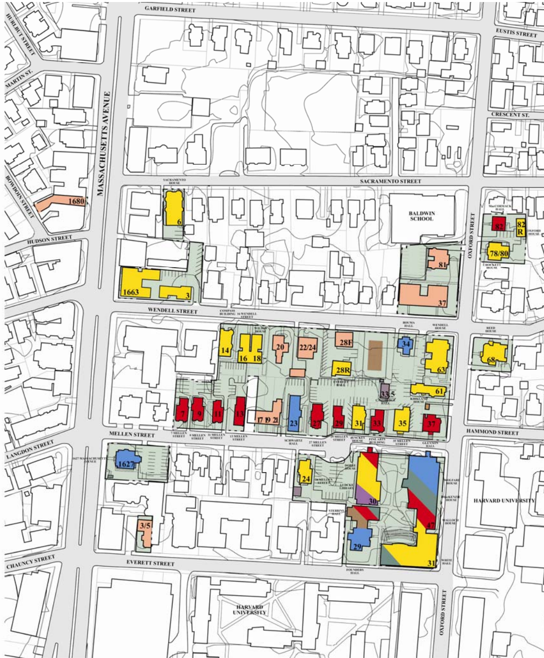
Figure F-1: PREDOMINANT USE AND PROPERTY –Quad Campus